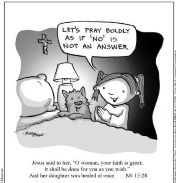
The Little Ones Jim Burrows